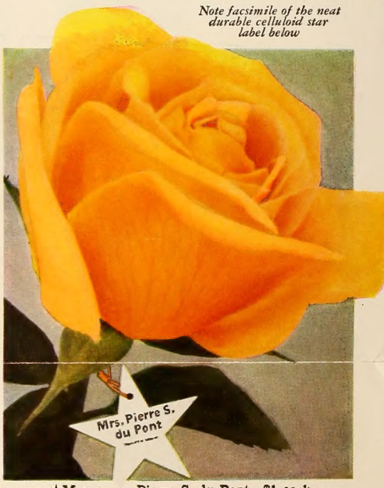
Note facsimile of the neat durable celluloid star label below

H ERE'S a collection of the choicest 12 everblooming Roses we have EVER offered in any group or set at such a low price. The 12 include the most dependable and free-blooming Roses in shades of red, pink, tinted, and yellow. Every one of the 12 is distinctly different, and if planted this fall the veriest amateur who follows our cultural directions can confidently depend on superb Roses next June and until late fall. Twenty vases of 12 or more Roses is not too much to expect from this STAR DOZEN the first year it is planted. At single rate they amount to $10.75.